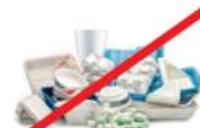
NO Polystyrene Foam