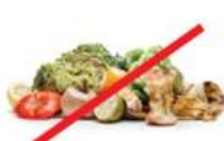
NO Food & liquids