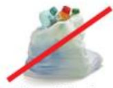
NO Recyclables in Plastic Bags