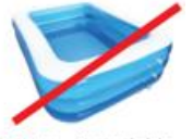
NO Non-Recyclable Plastic